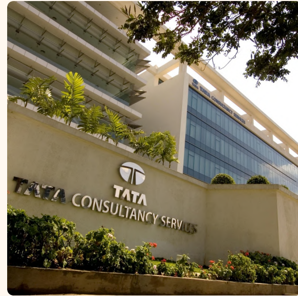
Tata Consultancy Services

MNC providing innovative solutions and services.